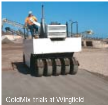
ColdMix trials at Wingfield

Bitumate is gaining acceptance within the recycled asphalt market and has been adopted by numerous regional councils, over the past three months. Some of the more prominent projects have been undertaken by the District Council of Mt Barker, City of Playford, and AusBulk South Australia's premier grain handler.