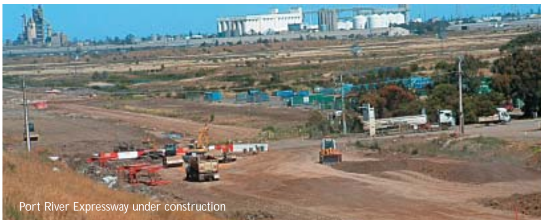
Port River Expressway under construction