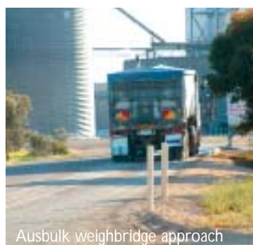
Ausbulk weighbridge approach