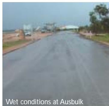
Wet conditions at Ausbulk

I know the people on the ground at the Tailem Bend site are delighted and all being well, we will look to do similar work at other AusBulk locations. Besides the product itself, the backup from Resourceco's personnel has been outstanding."