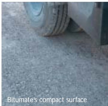
Bitumate's compact surface

Bitumate is gaining acceptance within the recycled asphalt market and has been adopted by numerous regional councils, over the past three months. Some of the more prominent projects have been undertaken by the District Council of Mt Barker, City of Playford, and AusBulk South Australia's premier grain handler.