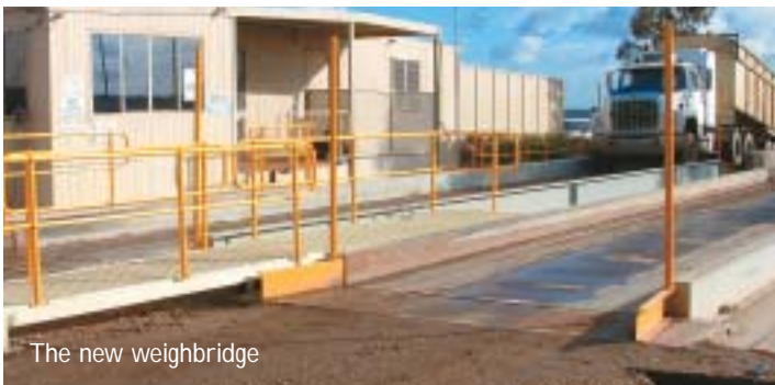
The new weighbridge